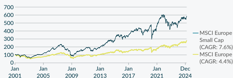
Graph 1: Substantial long-term outperformance: MSCI Europe Small Cap vs MSCI Europe