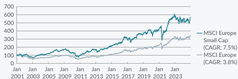
Graph 1: Substantial long-term outperformance: MSCI Europe Small Cap vs MSCI Europe